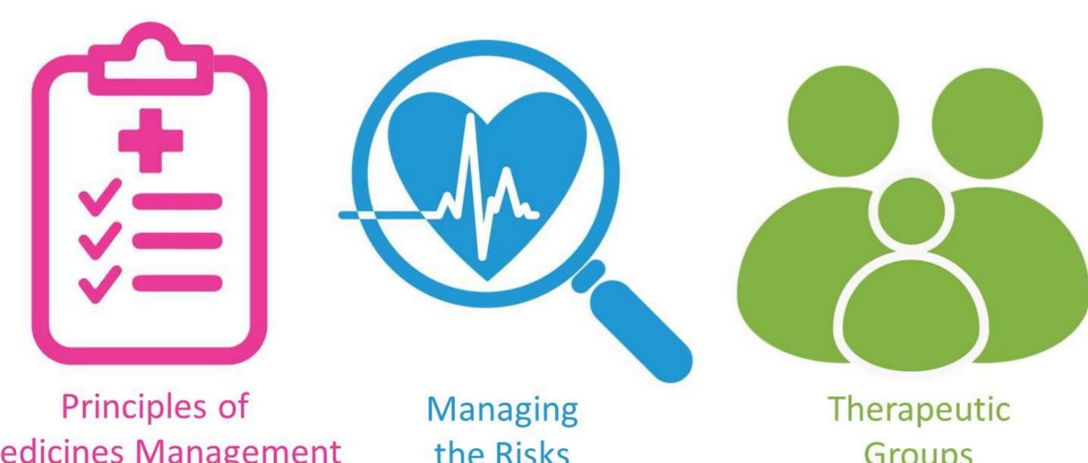
Figure 1: Nursing SCRIPT module categories

For further information please contact: script@contacts.bham.ac.uk